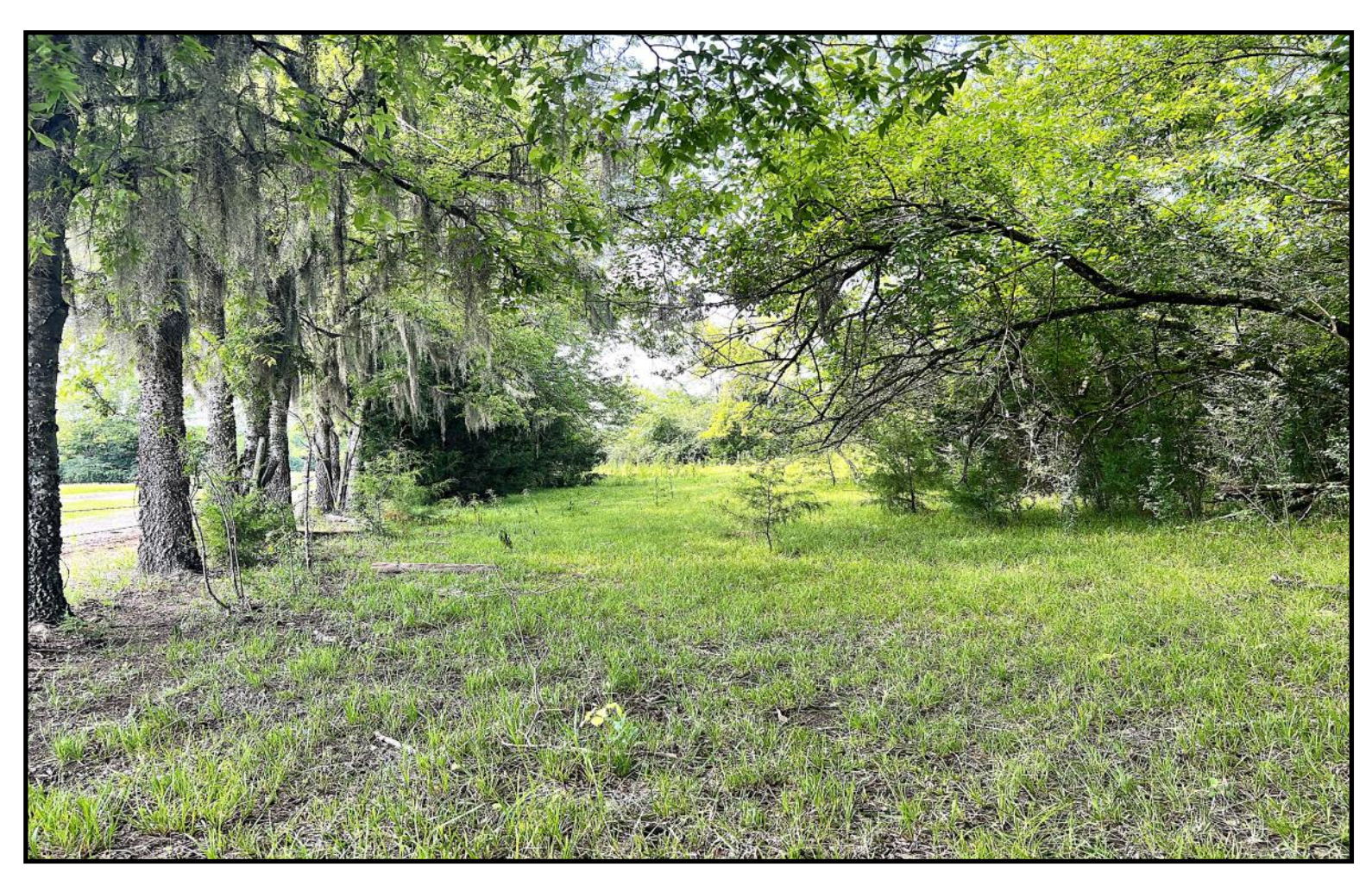
(Below) Access is directly off of Old McGehee Road. (Above) View looking south towards the entrance road.