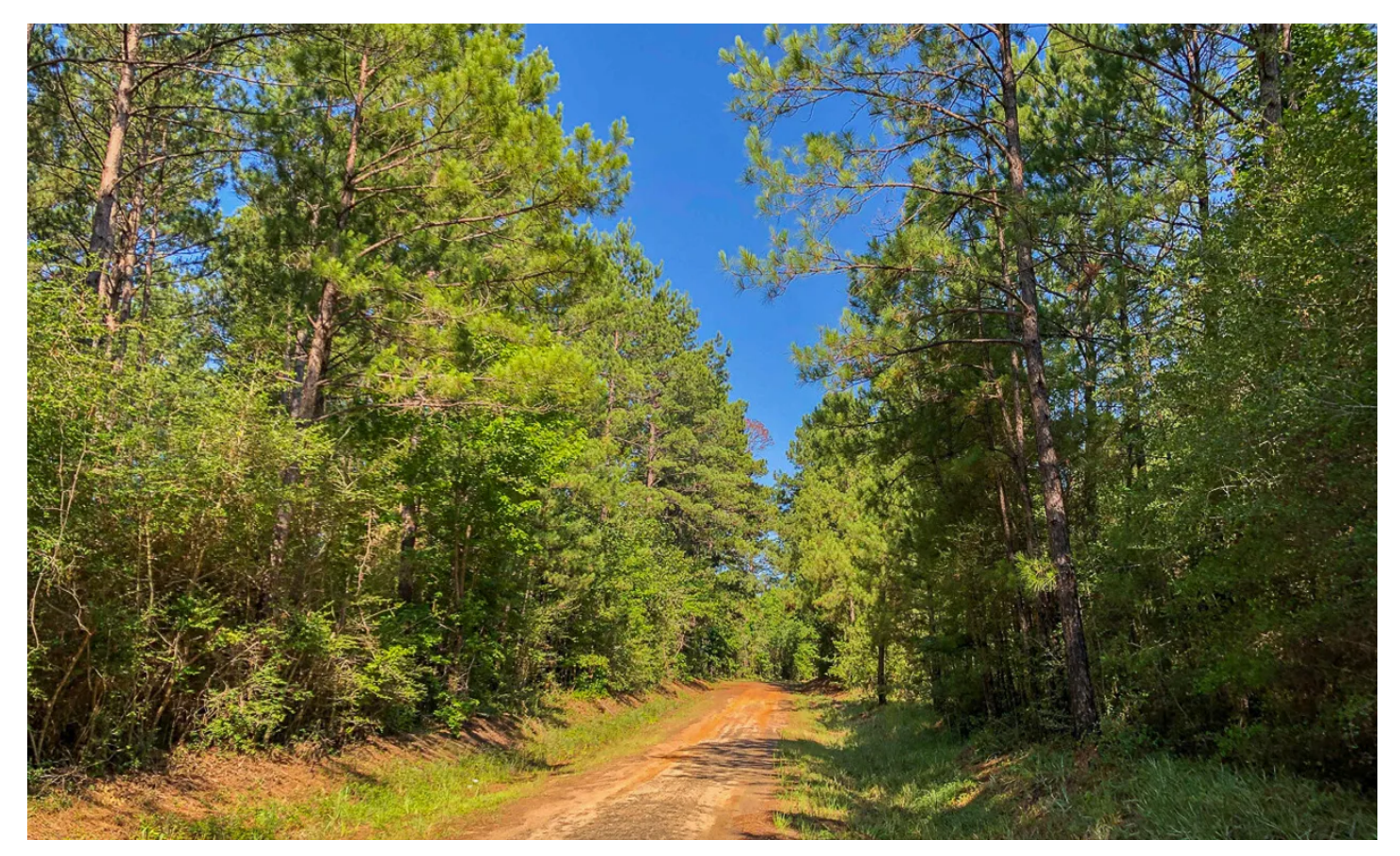
$45,000 6± Acres Angelina County