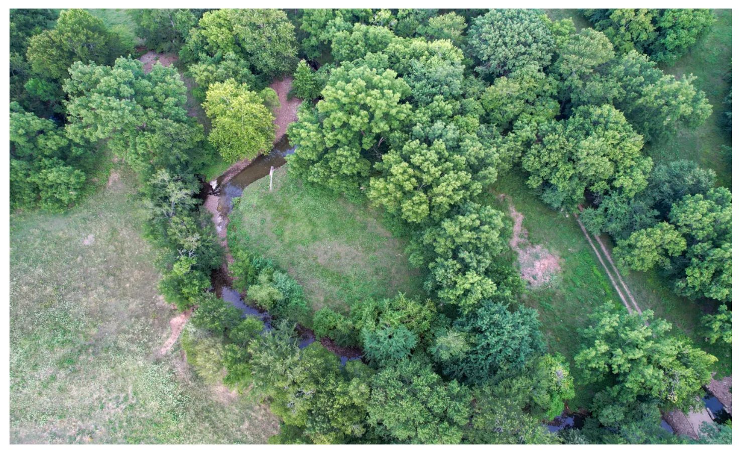
$600,000 136± Acres Sequoyah County